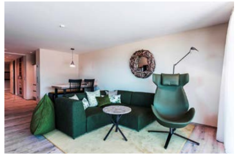
Berg und Tal (Pfronten, Germany)