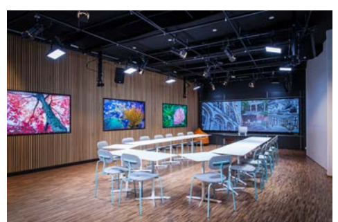
The Fourth, Tafelrond Hotel (Leuven, Belgium)