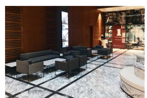
Dubai World Trade Centre (Dubai, United Arab Emirates)