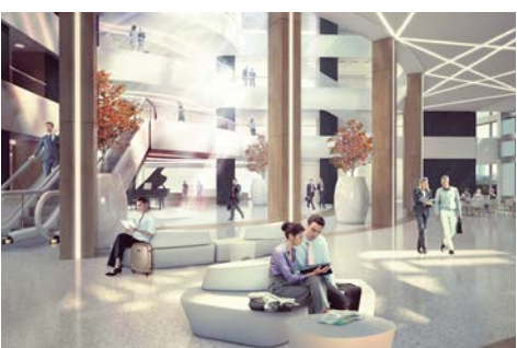
Warsaw Trade Tower (Warsaw, Poland)