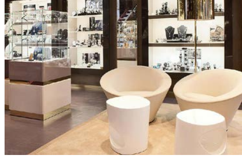
Stroili Oro (–, Italy)