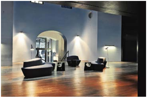
Alma Hotel (Barcelona, Spain)