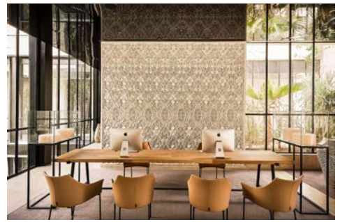
Sahrai Hotel (Fez, Morocco)